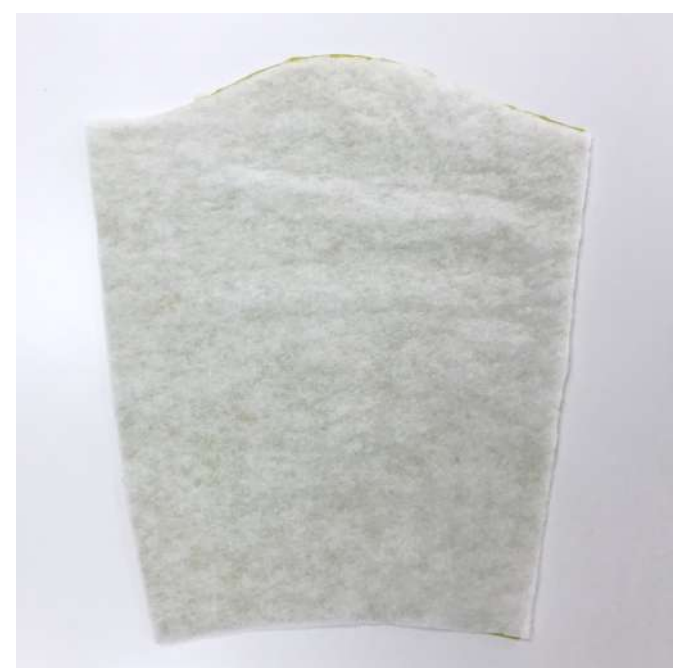
Quilt the pieces:

Put the front, back and sleeve outer shell pieces together with the insulation pieces, with the wrong side of the outer shell facing the insulation.