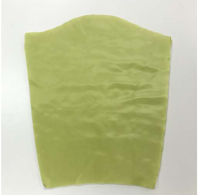
Add the lining pieces on top, with the wrong side of the lining facing the insulation.