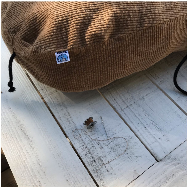
WENDEÖFFNUNG SCHLIEßEN ♡