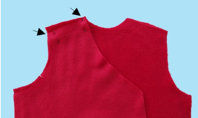
Assembling: Outer fabric and lining the same!