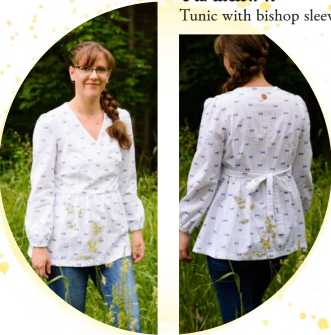
Variation 1: Tunic with bishop sleeves