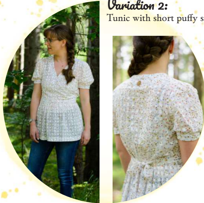
Variation 2: Tunic with short puffy sleeves