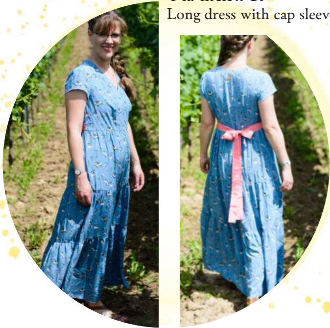
Variation 3: Long dress with cap sleeves