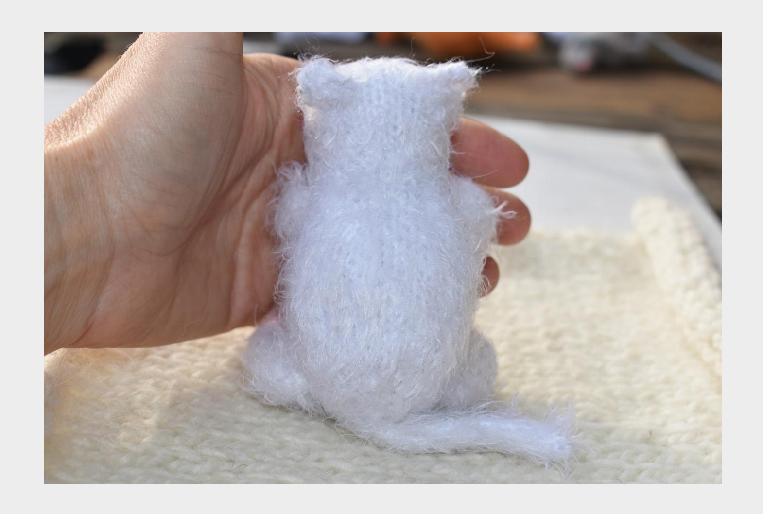
The Little sleeping kitten is finished!